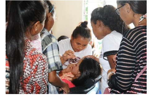
The prospective beauticians are curious to learn more.