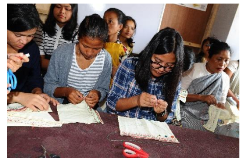
Full concentration is required when handling needle and thread.

Already very early in the training practical exercises are practiced.