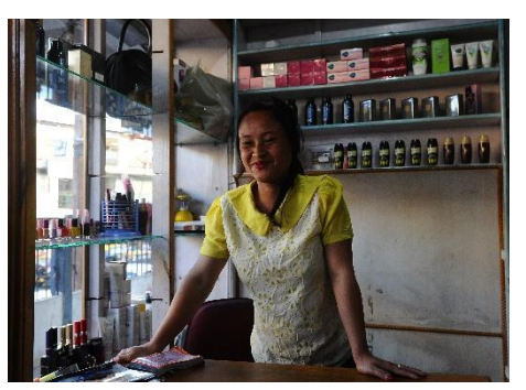
She has what many dream of - her own small company.