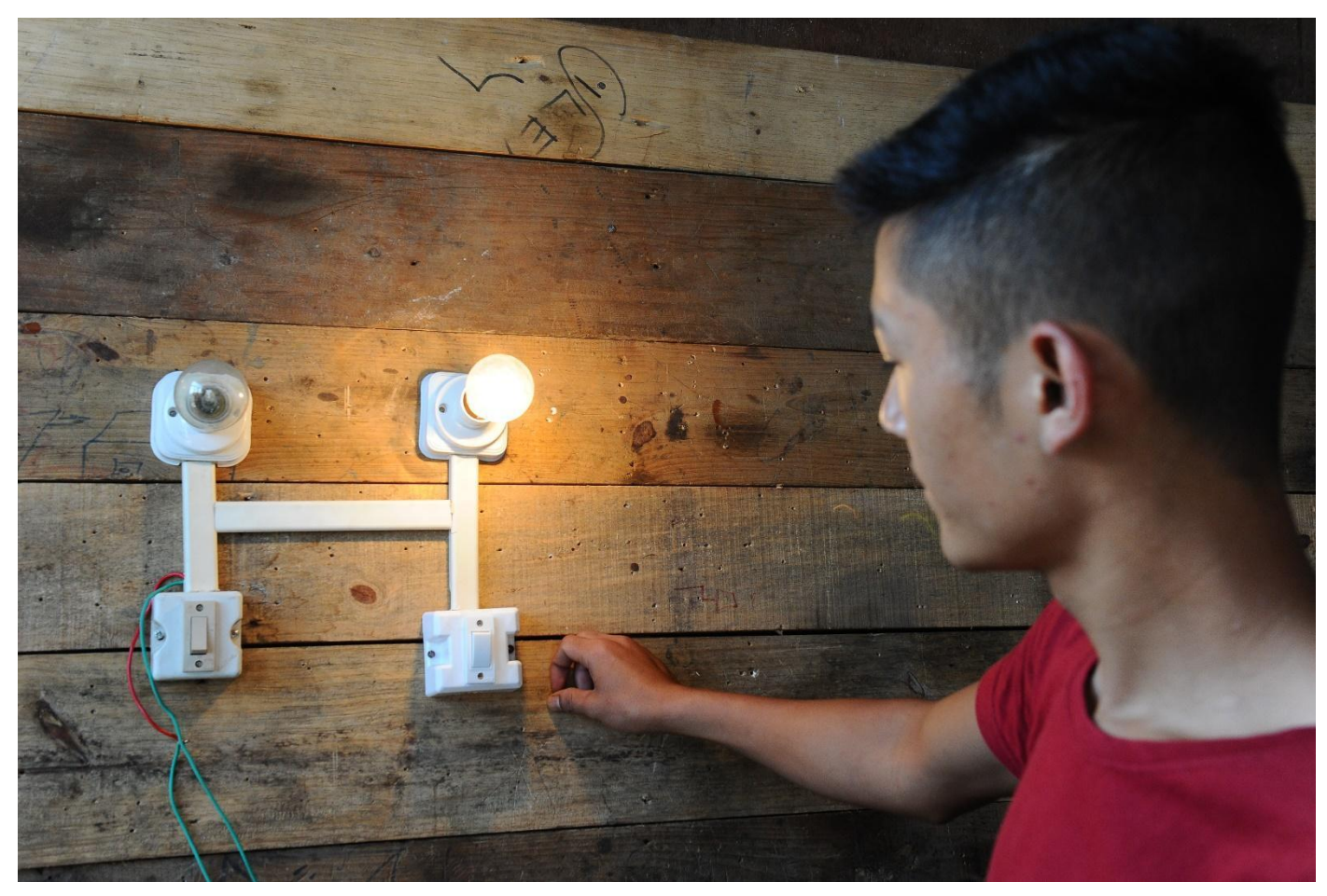
Vocational training opens up new perspectives for him. (Photo: Umsning, Meghalaya, 2019)

(Meghalaya and Assam, Northeast India, Childaid Network project progress report and outlook, February 2020)